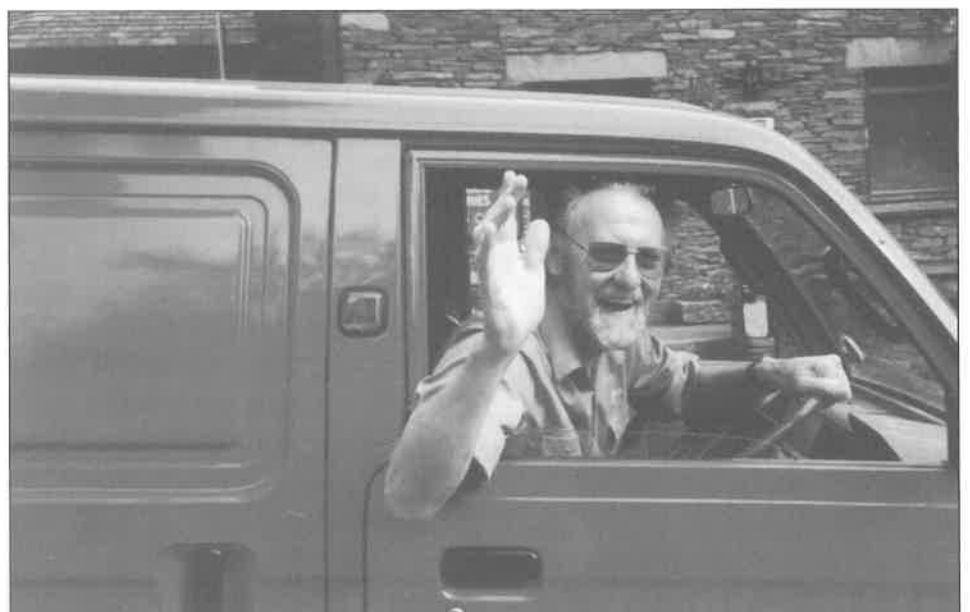
There's always a smile to welcome you to Langdale