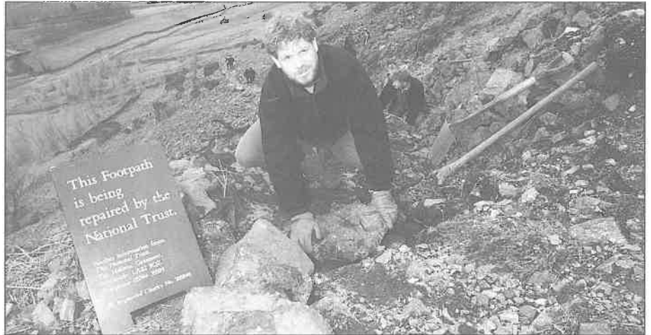
Footpath repair work on Raven Crag, Great Langdale

The employment of this additional person will allow The National Trust to