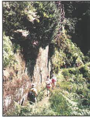
Left: Palace of the Winds, Jaipur. Right: Langdale walkers in Madeira

T he land of Maharajas, desert fortresses and opulent palaces beckons. Our trip to Rajasthan, India, in February 1999 represents something of a departure for Langdale Walking Holidays: it will be the first trip not to include walking.