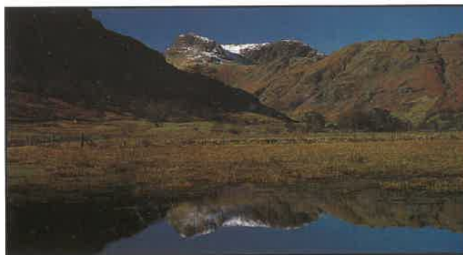
The Langdale Pikes in winter.

Come and recharge your batteries at Langdale this winter. Here are details of our special seasonal promotions