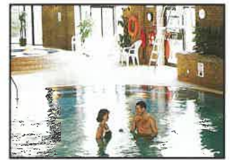
Left: timeshare lodges at Craigendarroch. Above: the Country Club