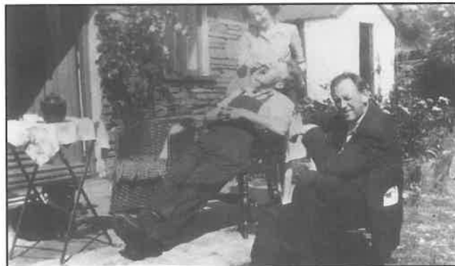
Schwitters (right) with friends outside Cylinders in 1947

The project was incomplete when Schwitters died in January 1948 and the Merz Barn deteri-