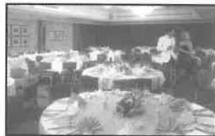
The Golden Valley Hotel

We are organising an exclusive Langdale Owners' black-tie dinner dance on the Saturday night before this year's AGMs, and a buffet lunch on the Sunday. We very much hope you will support the events, which will be a great opportunity for meeting up with