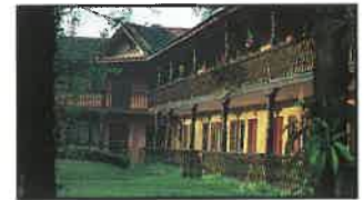
Peak of comfort: the Summit Hotel in Kathmandu, Nepal

Closer to home, we have also added a second holiday to Crete in May 1998, again because the first is full. The walking programme includes the incredible