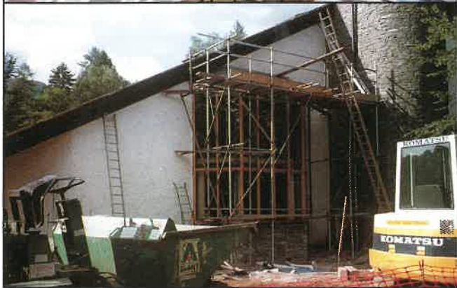
Top: The Terrace. Bottom: work in progress on the new spa