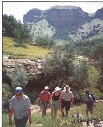
Left: Langdale walkers in the Drakensberg, South Africa, February 1998.