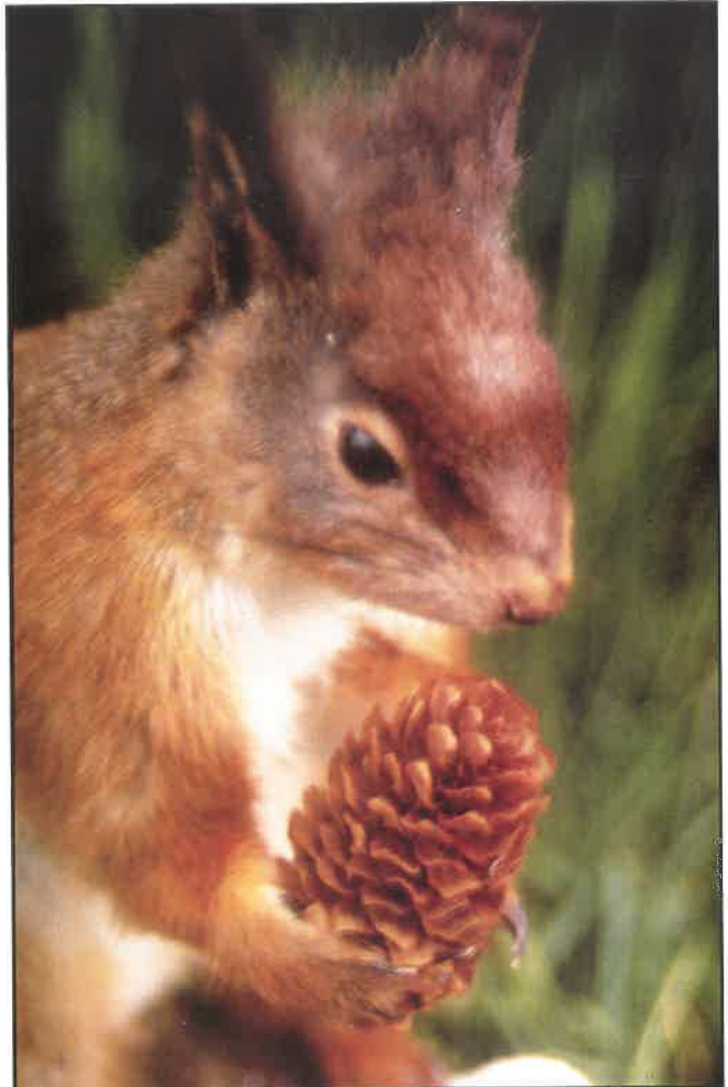
This is the kind of food red squirrels like!