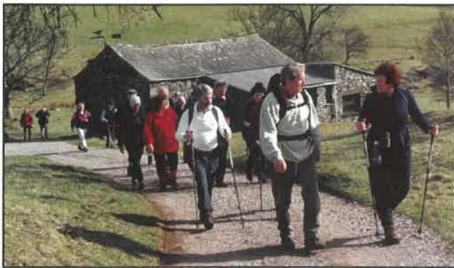
Langdale walkers