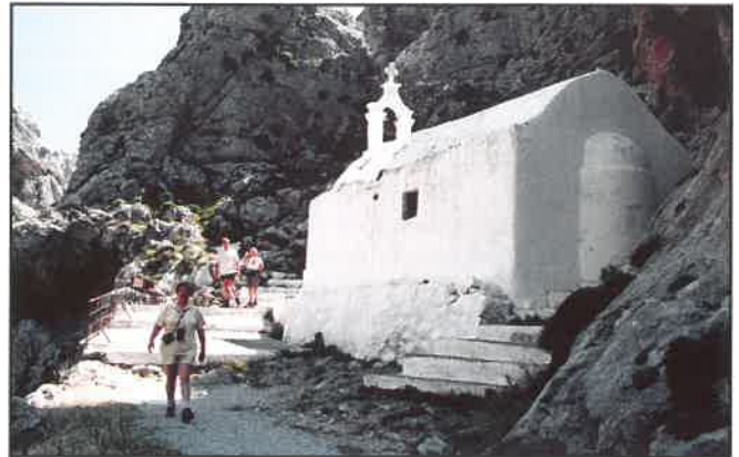
Top: Langdale walkers at the Church of St Nikolas, Crete, in May this year.