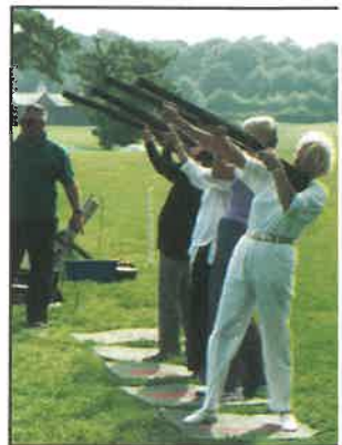
An Active Imagination clay pigeon shooting activity

Our daily delegates' rate is just £95 this winter for full board and accommodation, use of the Country Club and all conference