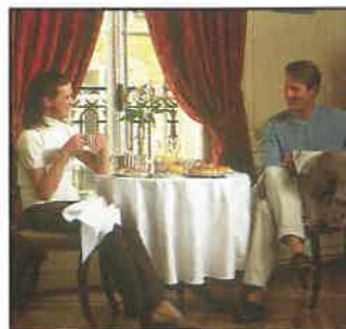
The Paris residence

2001 - the Real Millennium! So, to celebrate we've come up with a double bargain. Firstly, we've got prices to match the year - nine Chapel Stile weeks for just £2001 each - and we've also got a further 15-20 at 60%-70% discount. These have become available due to the discontinuation of our part-exchange system. Secondly, you can make these weeks work brilliantly for you by using them as a bargain way of joining the