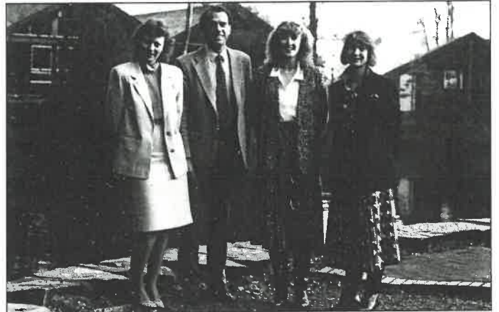
The time ownership sales team at your service ...