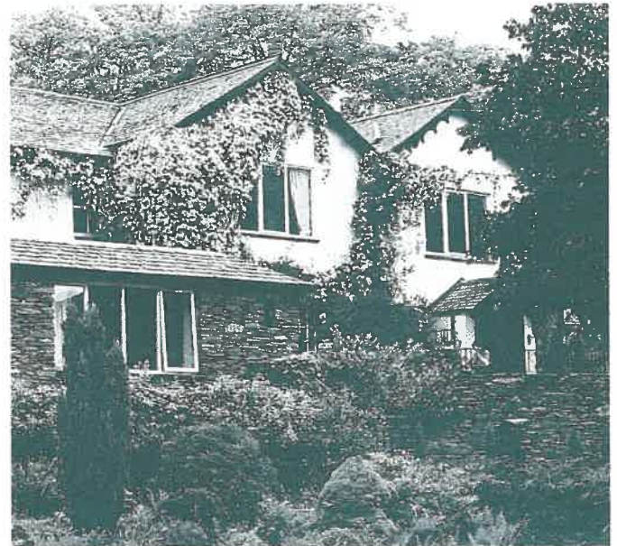
Above: The Chapel Stile apartments are set in private gardens.

We are currently offering some quite exceptional discounts on our remaining weeks at Chapel Stile, with around 50% off list prices (see right) If you are interested, call Sales on 015394 38012 .