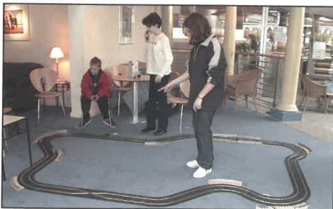
Let the kids have a go both indoors and outdoors: Scalextric, Big Splash pool games, archery, soccer, raft building, canoeing and more!

If you leave it too late, you'll be disappointed. Instead - plan ahead and book a Christmas Party Night 2001 at the Langdale Hotel and Country Club for just £65 per person, per night. This break includes a three course dinner with coffee, a disco, bed and breakfast and free membership to our newly refurbished Country Club. You set the mood and we'll get the party going. Group and corporate Party Nights are bookable in Purdey's on Fridays and Saturdays throughout December. Ideal for the office party, or a great night out for any group of friends.