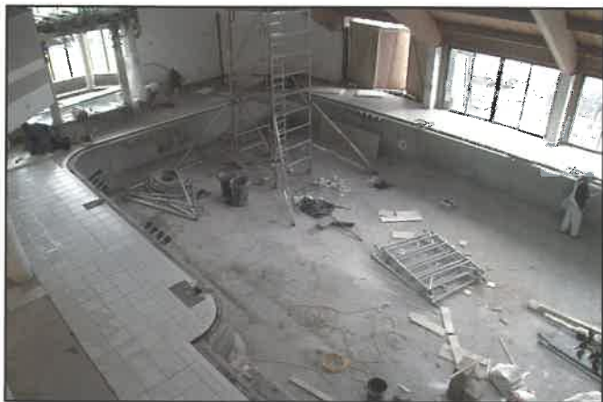
Getting ready for re-opening.

If you can't come yourself... send a friend... the Lake District needs you now.