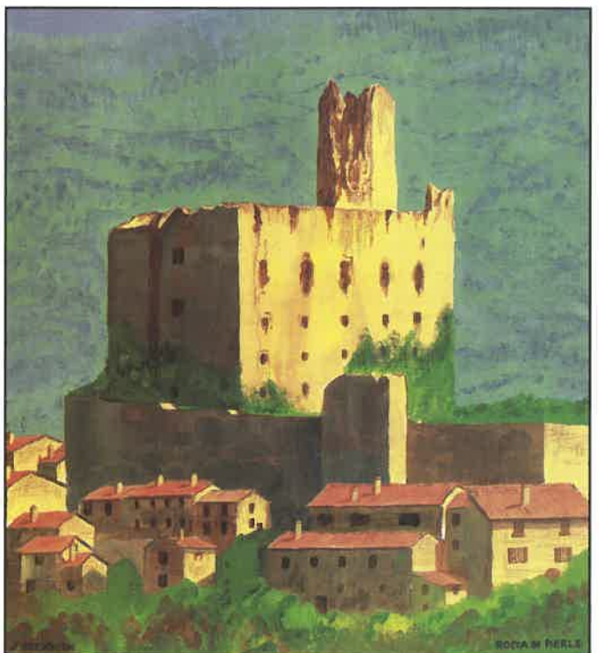
Rooms With A View - Pierle Castle, painted by Jim Cockburn from his home at Borgo di Vagli.