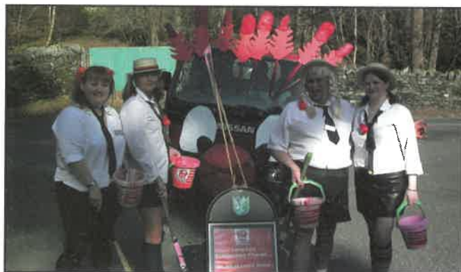
Pictured below are escapees from St Trinian's, aka our Housekeepers and Grounds Staff in their specially adapted Congestion Charge Truck.