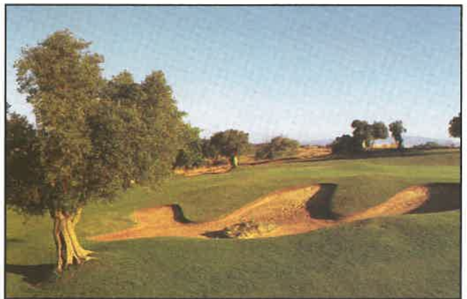
Tee-time! New nine holes at the Gramacho Golf Course, part of Pestana's Carveiro resort. Also nearby is its sister course at Pestana Golf Resort, which is an 18-hole course.