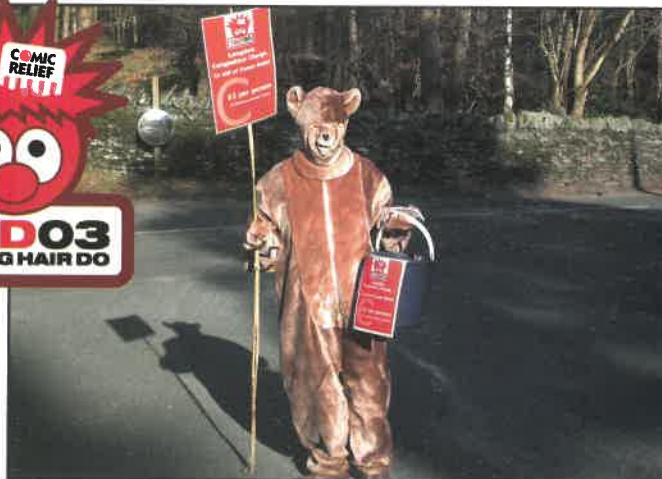
Pictured above is our "Traffic-Bare": please note the deserted road... but - Guess Who???