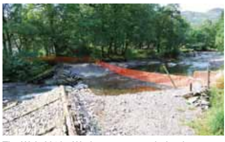
The Weir 2010 - Work starts to repair the damage

3. Sending a cheque to Accounts at Langdale - Payable to 'Langdale Leisure Ltd'