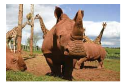
South Lakes Wild Animal Park