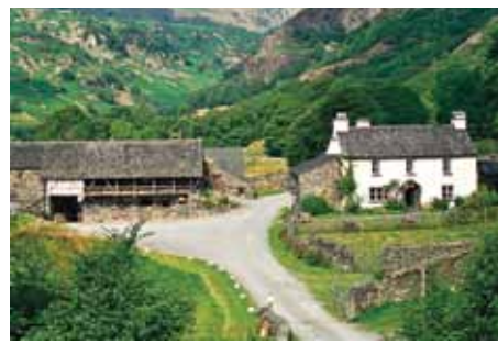
Yew Tree Farm