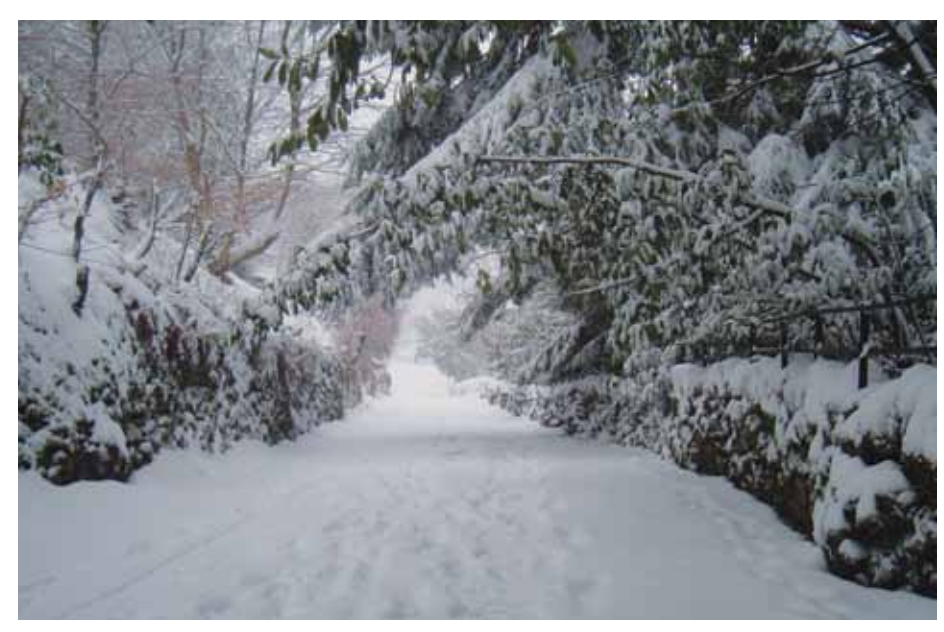
The road from Langdale to Ambleside

As recent winters have thrown up some interesting weather conditions with heavy rainfall and snow, the management company would like to let all owners know about the contingency plans that are always in place to ensure the health and safety of all guests at Langdale.