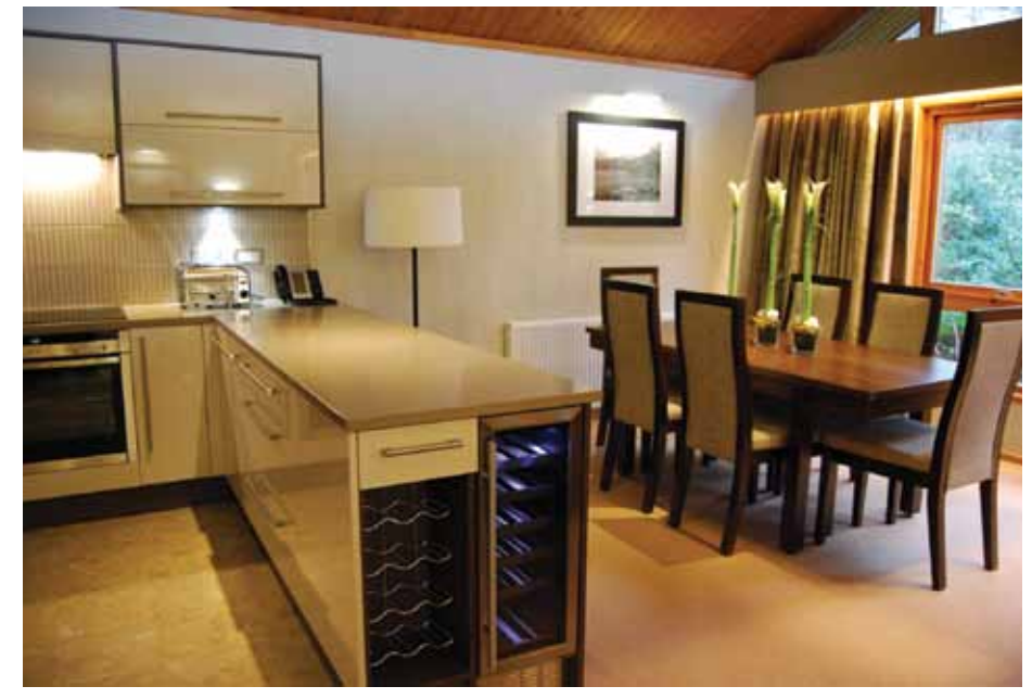
New Kitchen & Lounge

We are also starting a programme of lock