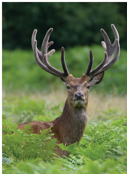
Red Deer Stag