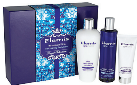
Elemis Gift Sets