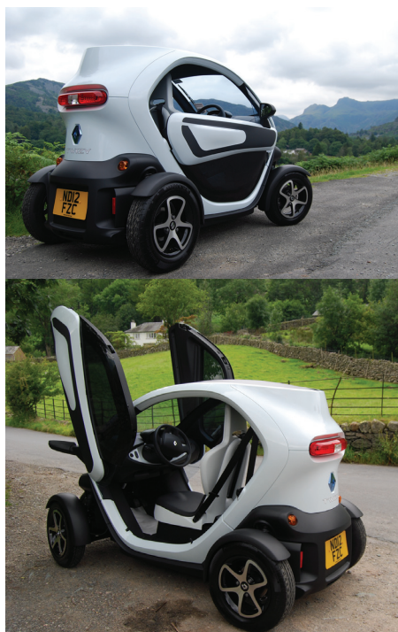
Renault Twizy Electric Car

An electrifying drive in the beautiful Lake District is now available at Langdale in one of two Renault Twizy electric cars. The two-seater Twizy is partly open to the elements and because there is no engine noise it is a great way to experience the sights and sounds of the Lakeland countryside.