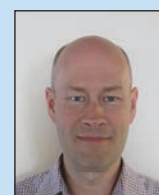
Kit Bird Owner