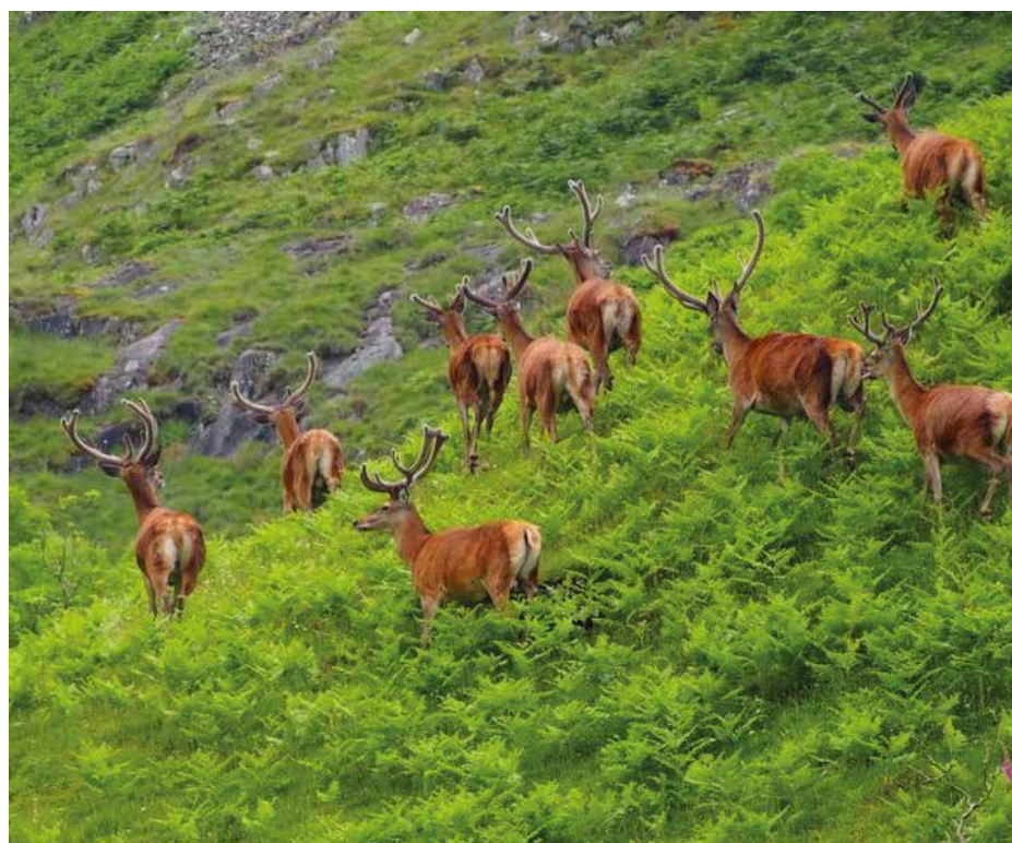
Red Deer at Martindale