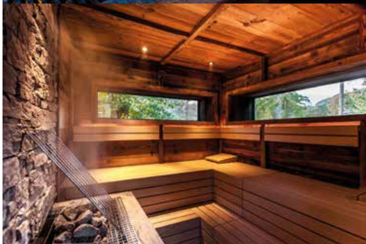
Outdoor Finnish Sauna

By the time you read this Stove Restaurant will have been open for five months and Brimstone Spa will be opening its doors to guests for the first time. Visit the website for images and full information.