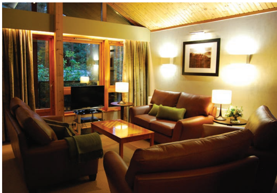
New Style Lodge Lounge