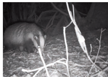
Badger caught on trail cam at night